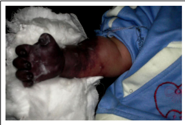
Figure 1. Gangrene of the right hand and right forearm.