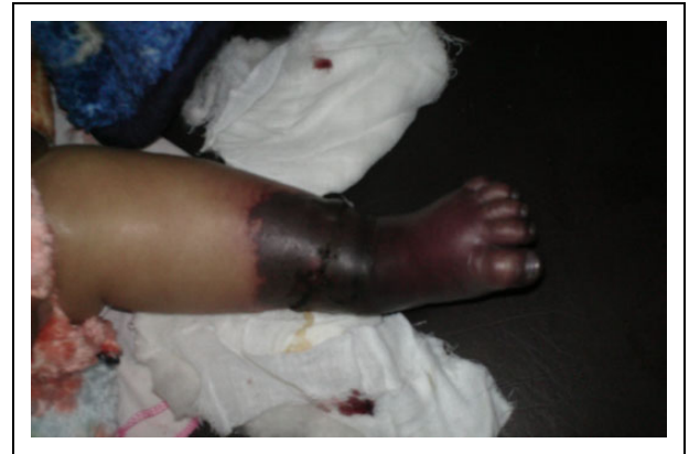
Figure 2. Gangrene of the left foot and left leg.

Sixty-three patients were included in this study. They were 36 males and 27 females with the male to female ratio of 1.3:1. Their age ranged from 3 up to 302 days with a mean of (72.10 \pm 61.60). Most patients were premature 79% (n = 50), with a gestational age range from 32 to 34 weeks (mean = 33 \pm 8; Table 2). Forty-one (65%) patients had VT in the upper limb (Figure 1), whereas the remaining 22 (35%) had lower limb VT (Figure 2). Out of those 41 patients with upper limb VT, 4 (6.5%) patients had only 1 finger gangrene. Three (5%) patients had gangrene affecting more than 1 finger, and 1 patient (1.5%) had gangrene of the whole hand. On the other hand, 4 (6%)